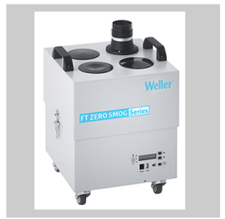
Fume extraction devices