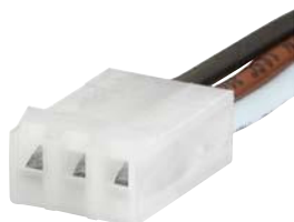
Wire Harness Wire harness for SCHURTER products