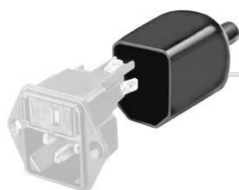
Assorted Covers Rear Cover