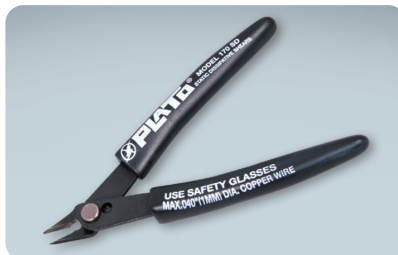
NIPPER PLATO 170SD ESD

- COOPER WIRE : 1,0mm - ESD (Anti-static)