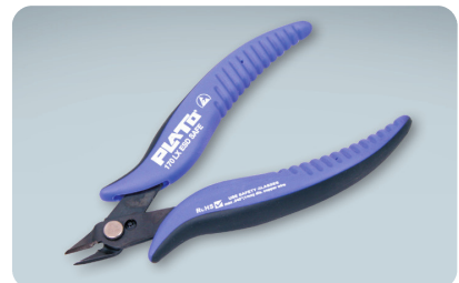
NIPPER PLATO 170LX ESD

- COOPER WIRE : 1,0mm - ESD (Anti-static)